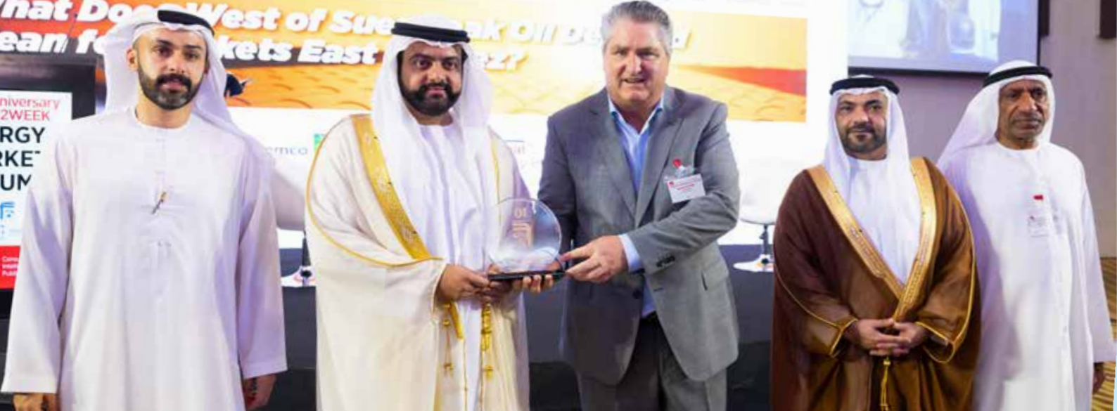
His Highness Sheikh Mohammed bin Hamad bin Mohammed Al Sharqi, Crown Prince of Fujairah opens the 10th Anniversary of Energy Markets Forum 2022 at Novotel, Fujairah.