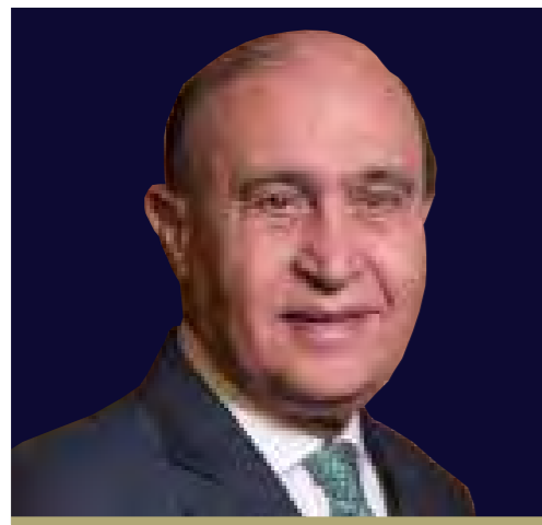
H.E. Admiral Mohab Mamish Chairman Suez Canal Authority, Egypt