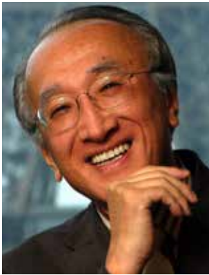
Nobuo Tanaka, Global Associate for Energy Security and Sustainability at the Institute of Energy Economics Japan, Professor of the University of Tokyo and former Executive Director of the International Energy Agency (IEA)