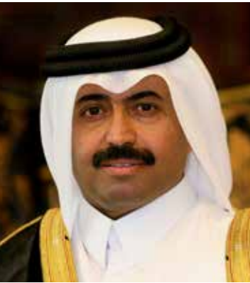
His Excellency Dr. Mohammed Bin Saleh Al-Sada, Minister of Energy and Industry, Qatar & Chairman of the Board of Qatar Petroleum