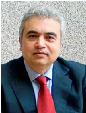
Dr. Fatih Birol, Chief Economist & Director of Global Energy Economics, International Energy Agency (IEA)

Lifetime Achievement for the Advancement of Producer- Consumer Dialogue: