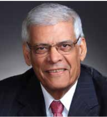
His Excellency Abdalla Salem El-Badri, OPEC Secretary General