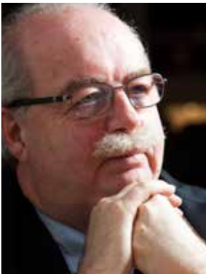
Christophe de Margerie, Former Chairman & CEO, TOTAL S.A.

Lifetime Achievement Honorary Award for the Advancement of International Energy Policy & Diplomacy: