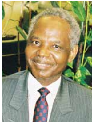
Dr. Rilwanu Lukman, Former OPEC Secretary General and Nigerian Minister of Petroleum