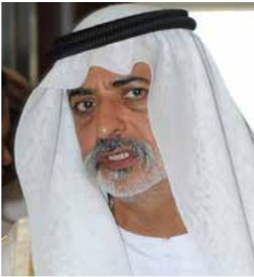
His Excellency Sheikh Nahayan Mabarak Al-Nahayan, Minister of Higher Education and Scientific Research, United Arab Emirates