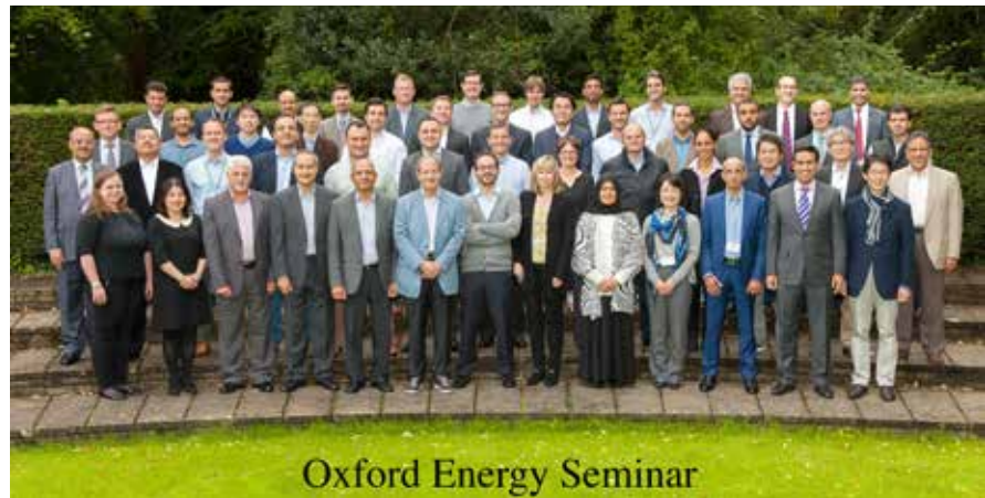
Oxford Energy Seminar