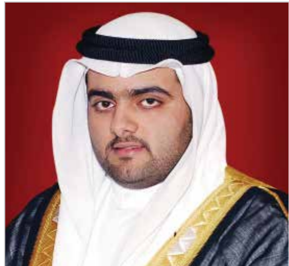
H.H. Sheikh Mohammed bin Hamad bin Mohammed Al Sharqi Crown Prince of Fujairah